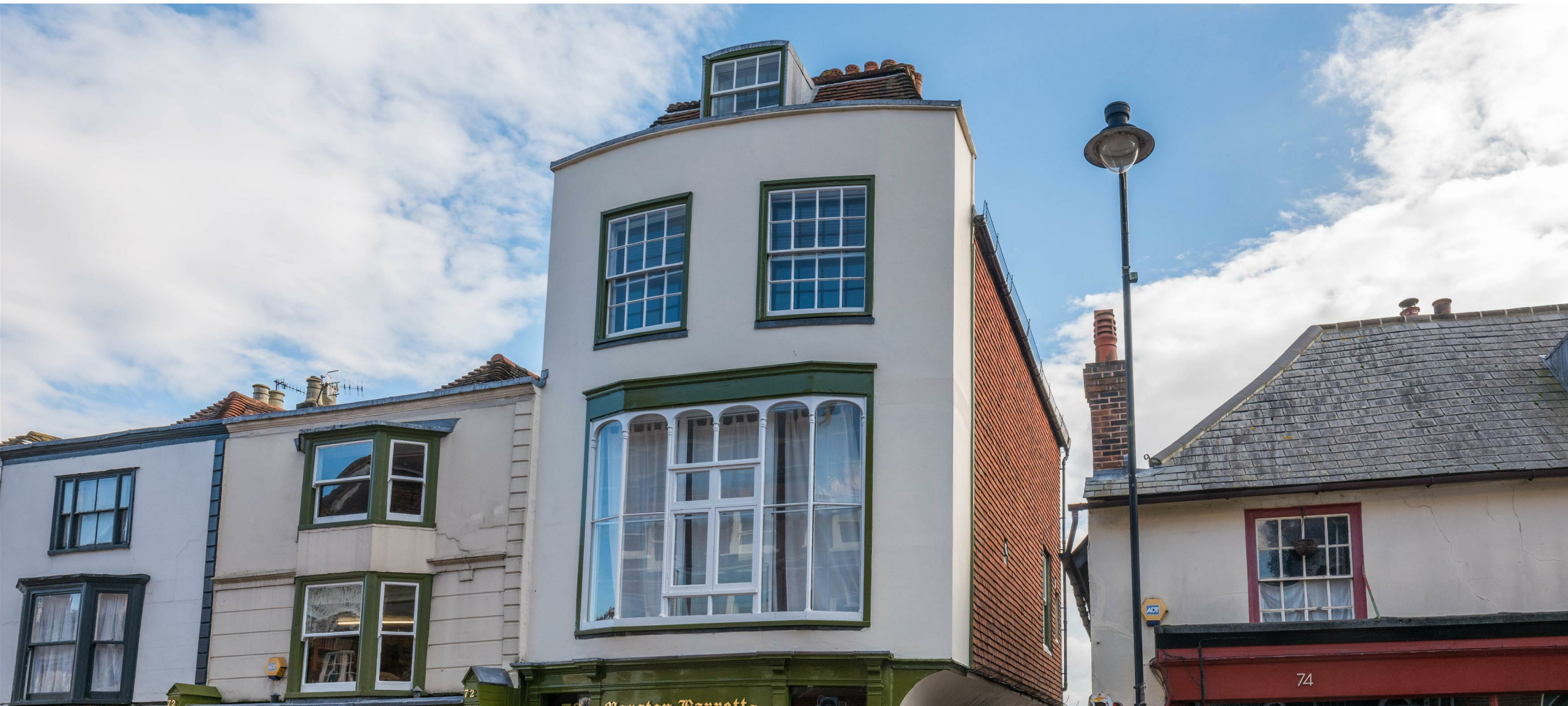
1A St. Martins Lane, Lewes